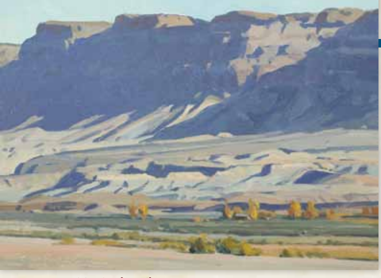
Repetition in Clay, oil, 11 x 14.